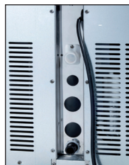
Recessed Connections Panel