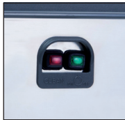
Front ON-OFF Switch