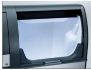
Hygienic scoop holder