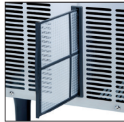
Proximity condenser air filter