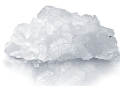
Residual humidity content 15%

Super-flake ice, extruded just below 0° Celsius, retains only 15-18% of residual umidity, making it relatively dry and compact.