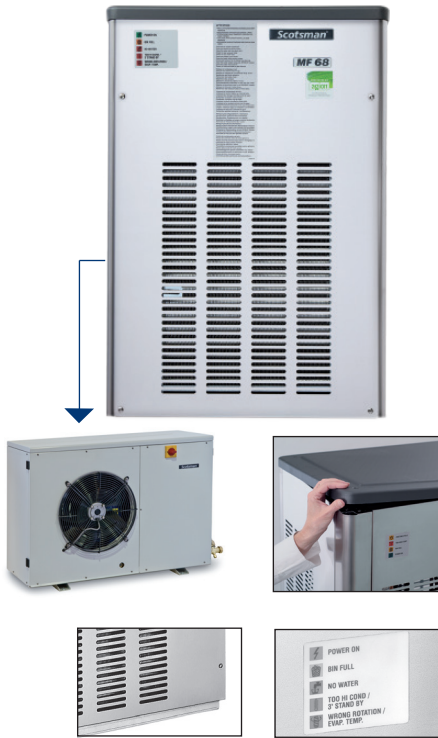
Stainless Steel Electronic Controls