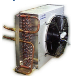
Optional Remote Condenser