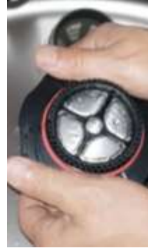
Clean micro-Filter with pump action