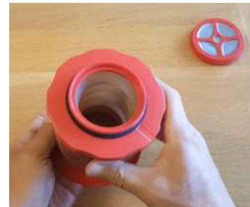
Ready to brew!