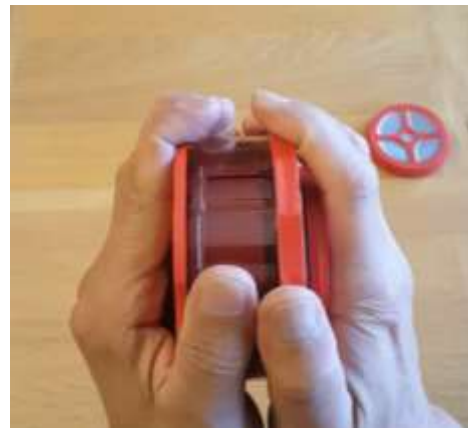
Check Press Guide & Pulling Plate and keep them tight again.