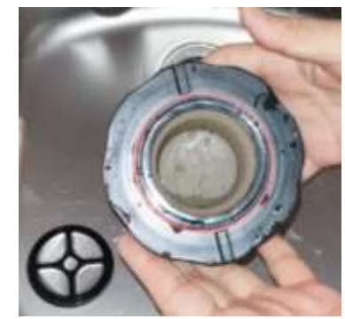
Filter and Chamber perfectly cleaned