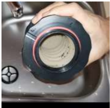
(residual still remained)