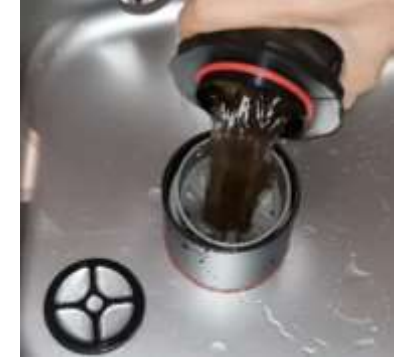
Shake, pour out while water being swirled