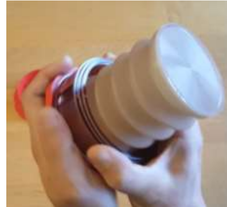
Screw up Press Guide and Pulling Plate, keep them tight...