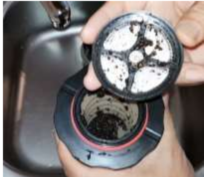
Open the Filter after press/squeeze