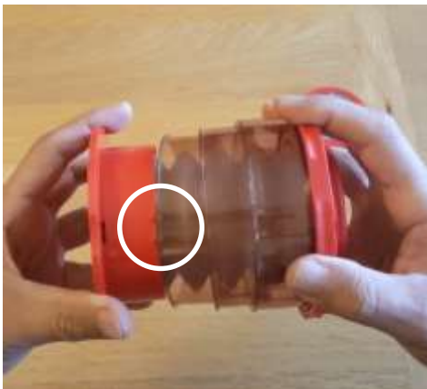
Lock tapered points with Press Guide and the other side