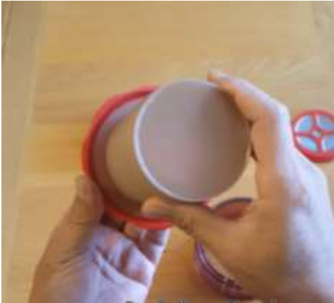
Put Bellows Chamber at the centre of Pulling Plate