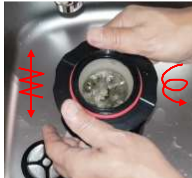
Slow pump and swirl action brings residual to bottom