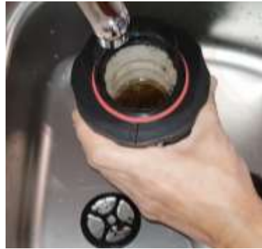
Fill up half with tap water, close Filter