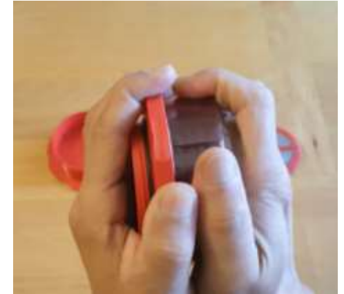
And keep them tight again to prevent any water leaks.