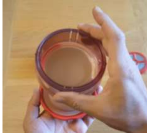
Align Press Guide into Pulling Plate