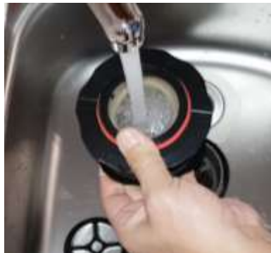
Put 1/4 water while squeezing bellows