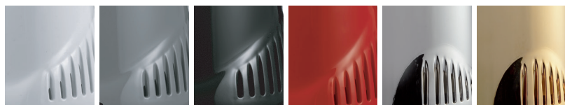
WHITE GREY BLACK RED CHROME SILVER CHROME GOLD